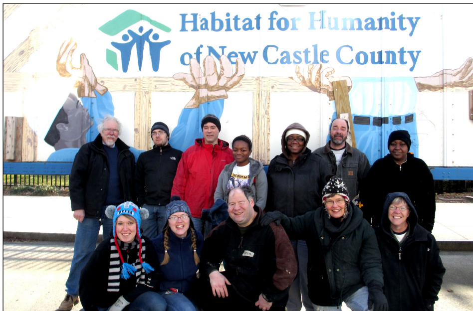
Here are some of the Hanover members and friends who gathered on Martin Luther King Day to work on a Habitat for Humanity home construction project on Lamotte Street in Wilmington. They can tell you all about installing fiberglass insulation, hanging drywall, and other skills — including staying warm.

Non-Profit Org. U.S. POSTAGE PAID Wilmington, DE Permit #45