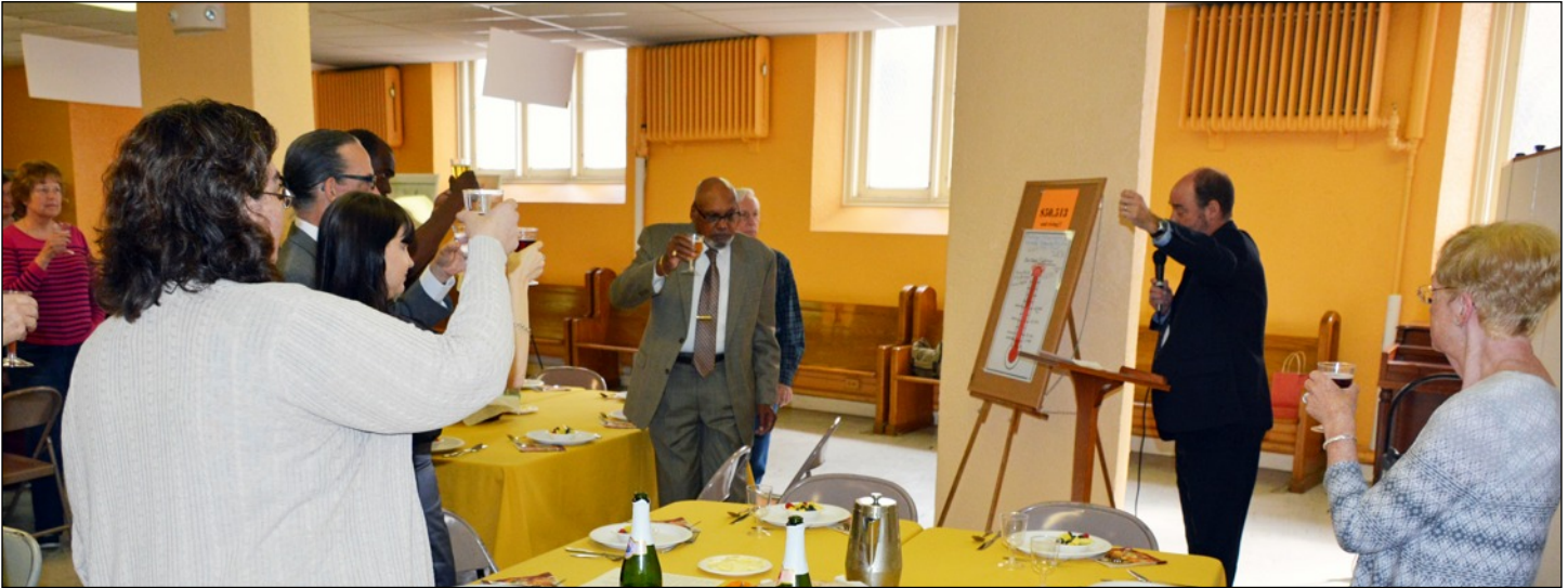
Luncheon guests toast the successful completion of the 200 for 200 campaign.

A newsletter for the people of Hanover Presbyterian Church, Wilmington, Delaware November 2016