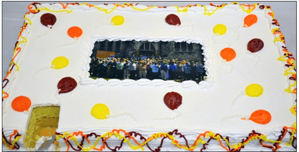
A cake decorated with a photo of Hanover members was the dessert.