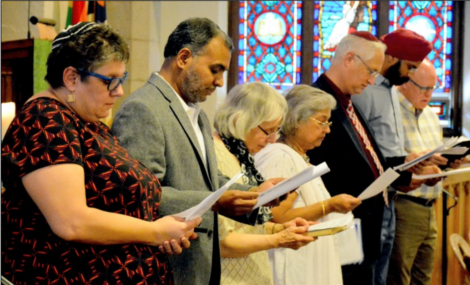
Seven representatives of various faith traditions gathered at Hanover on Sept. 24 for Interfaith Conversations. It was one of more than 50 events in Peace Week Delaware sponsored by the Movement for a Culture of Peace.

A newsletter for the people of Hanover Presbyterian Church, Wilmington, Delaware October 2017