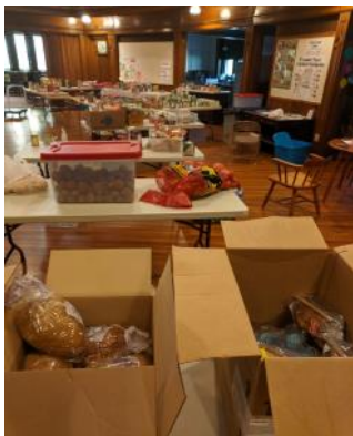
This is NOT the Super Sale!